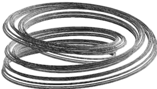
Figure: Smale's Solenoid